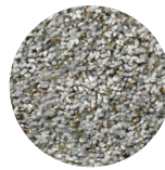
Carpet: Sierra Mist