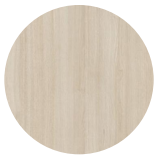
Cabinets: Free Spirit