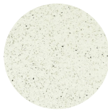
Quartz Countertops: Crystal Crescent