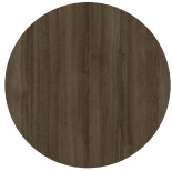
Cabinets: First Class